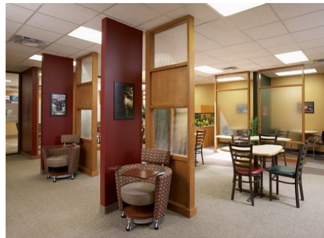
Our state-of-the-art training facilities in Burlington, Ontario, Canada